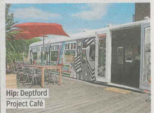
Hip: Deptford Project Café