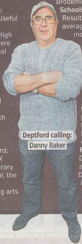
Deptford calling: Danny Baker

Who lives there? Young professional first-time buyers; creatives Famous faces: Danny Baker and members of Dire Straits lived in Deptford in the 1970s