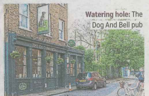
Watering hole: The Dog And Bell pub