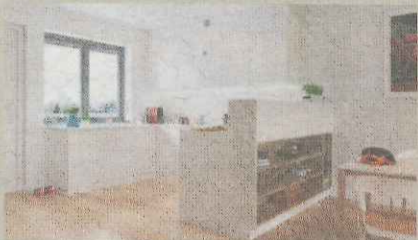
Pocket edition: A kitchen at Arklow Road

KENT Wharf comprises one, two and three-bed flats with open-plan living spaces, set in landscaped communal gardens. Bellway Homes is offering stamp duty paid or London Help to Buy on a selection of two-bed duplexes and three-bed homes, from £544,995.